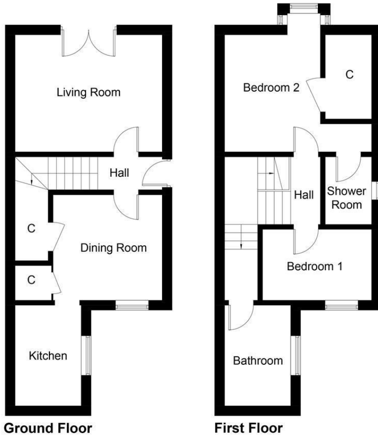
Illustration for identification purposes only, measurements are approximate, not to scale. floorplansUsketch.com © (ID1073926)