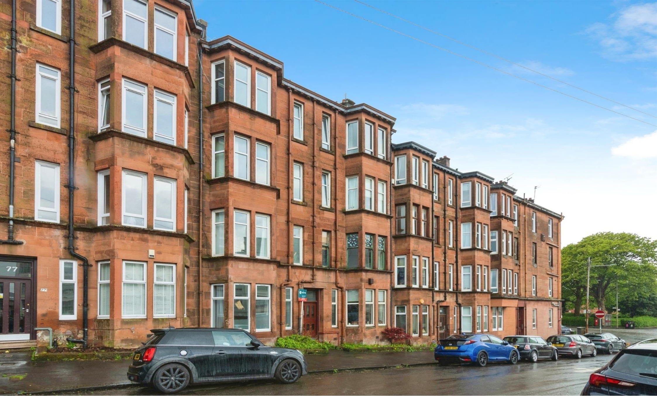
Tankerland Road, Glasgow G44 4EW