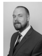
Professional photography GRANT LAWRENCE Photographer