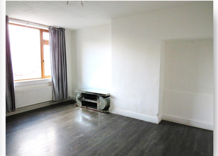
Duke Street, Bannockburn, Stirling, FK7 0JQ