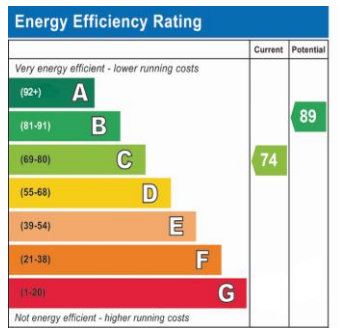
Illustration For Identification Purposes Only. Not To Scale (ID:1076622 / Ref:87903)