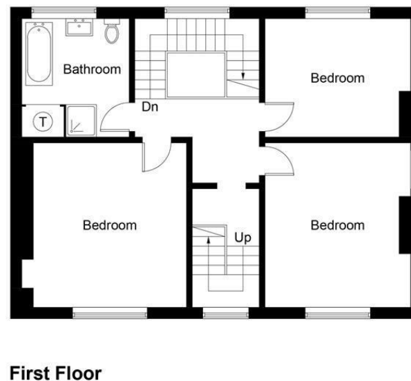
Illustration for identification purposes only, measurements are approximate, not to scale. floorplansUsketch.com © (ID1074340)