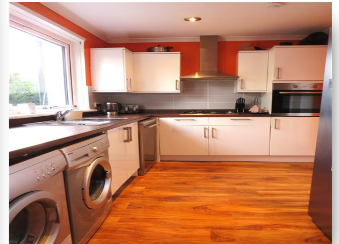
Burns Terrace, Cowie, Stirling, FK7 7BS