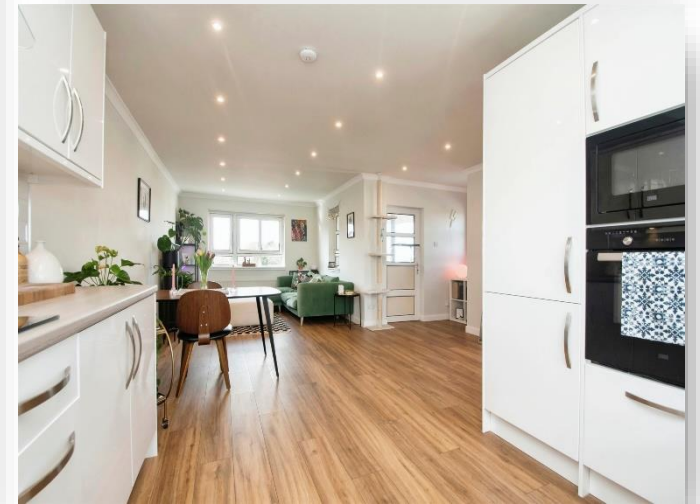
Castlemilk Drive, GLASGOW G45 9JZ